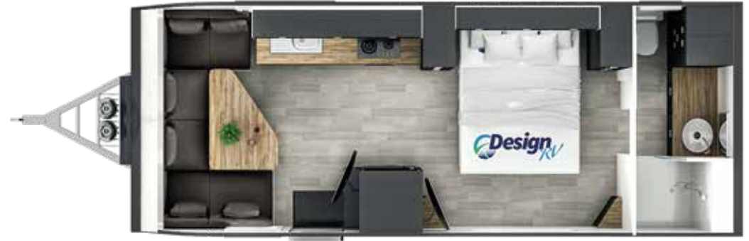
V8 · Size 21'10"