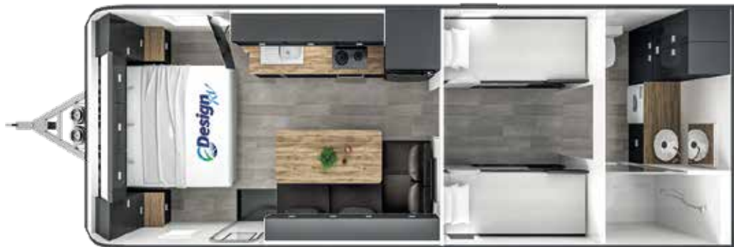
F4 · Size 24'8"