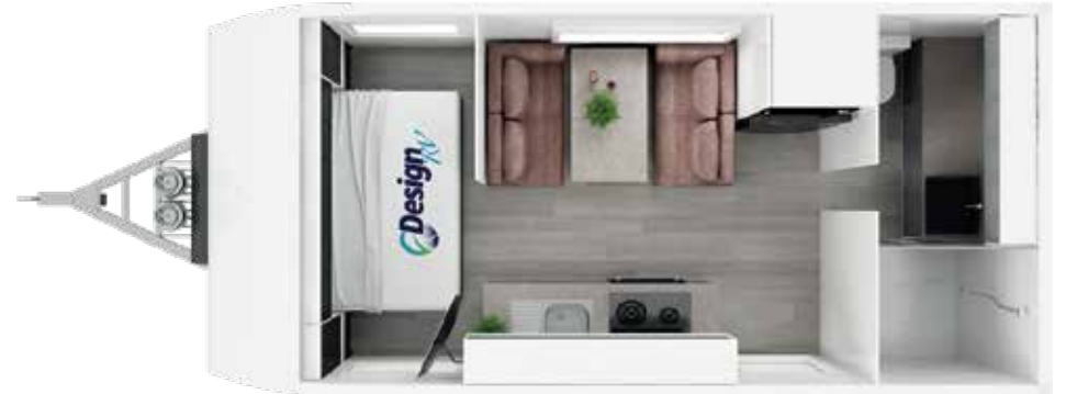
V1-1 · Size 18'8"