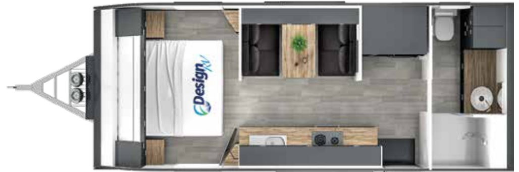
V6 · Size 21'