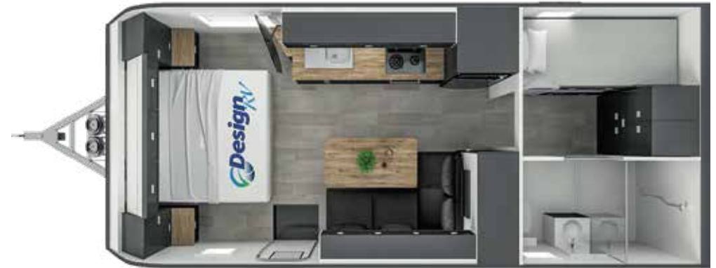
F2-6 · Size 21'10"