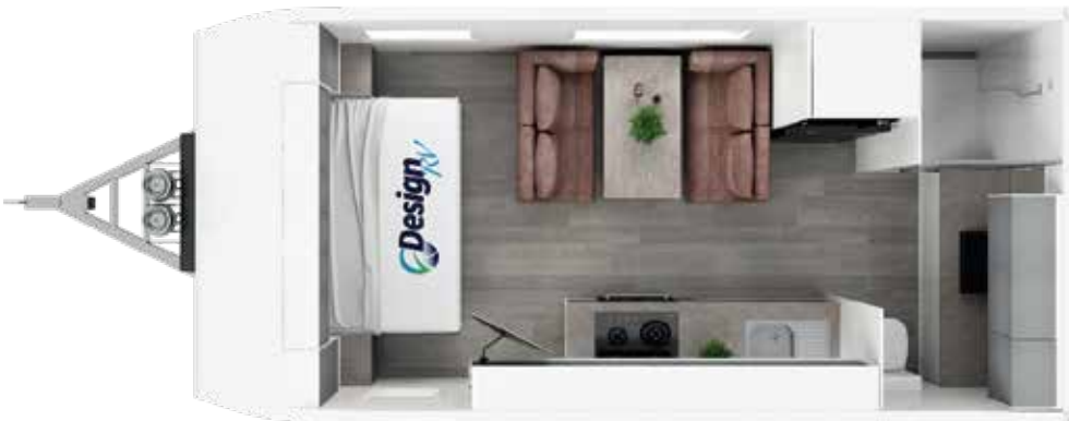
V2-1 · Size 19'