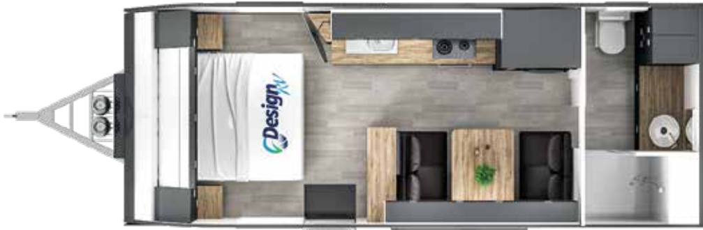
V5-3 · Size 20'6"