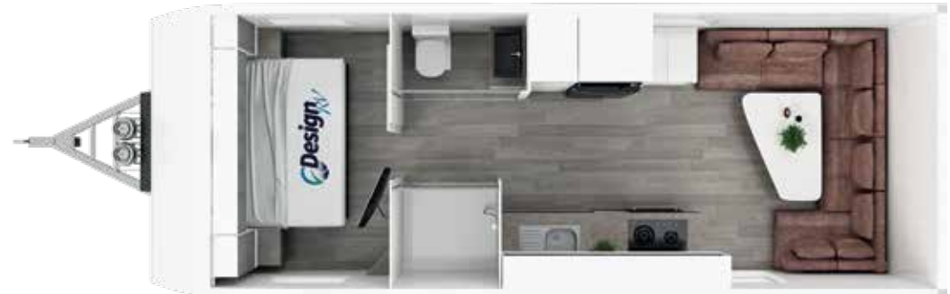
V10 · Size 22'10"