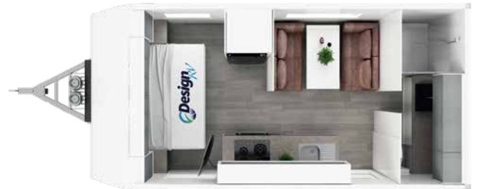
V3 · Size 19'6"