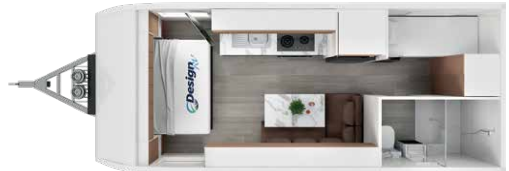
F2 · Size 21'