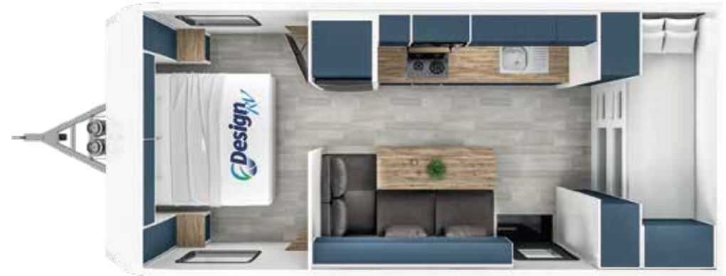
F1 · Size 20'