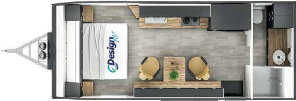
V7 RECLINER · Size 21'6"