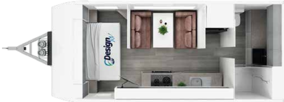
V4 · Size 19'8"