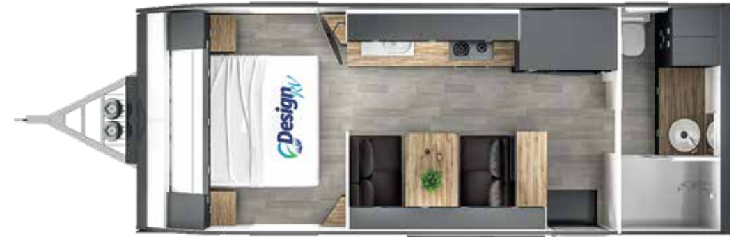
V5-2 · Size 20'6"