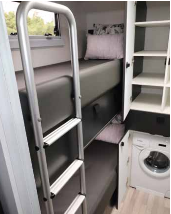
*Washing Machine Optional Extra on Family Vans