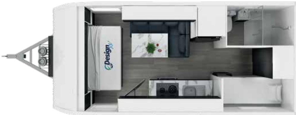
F1-5 · Size 20'6"