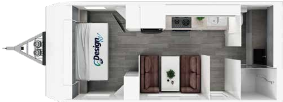
V5-1 · Size 20'6"