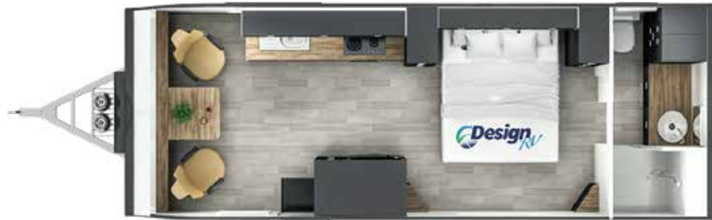
V8 RECLINER · Size 21'10"