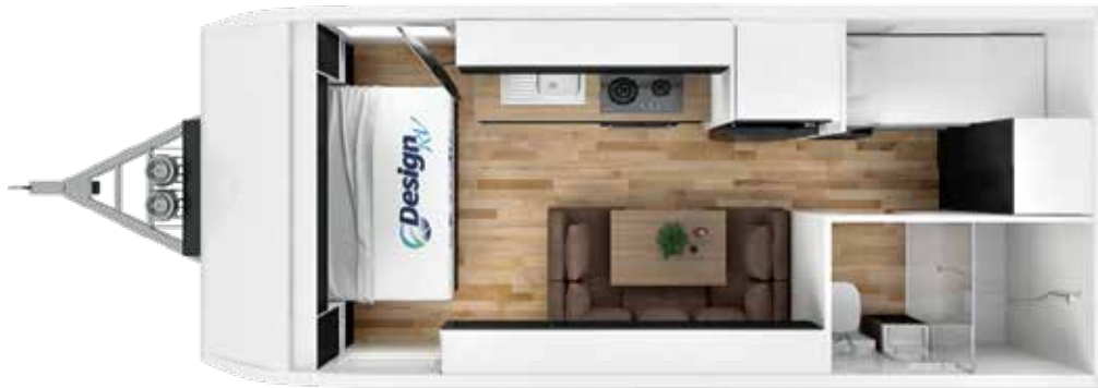
F2-5 · Size 21'10"