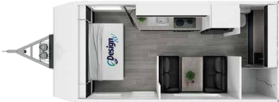
V1 · Size 17'