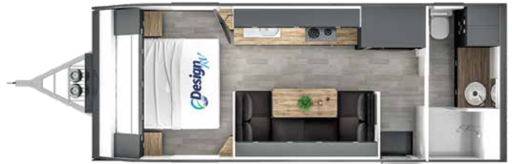
V7 · Size 21'6"