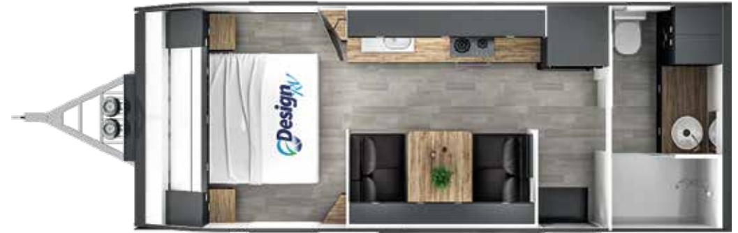
V5 · Size 20'