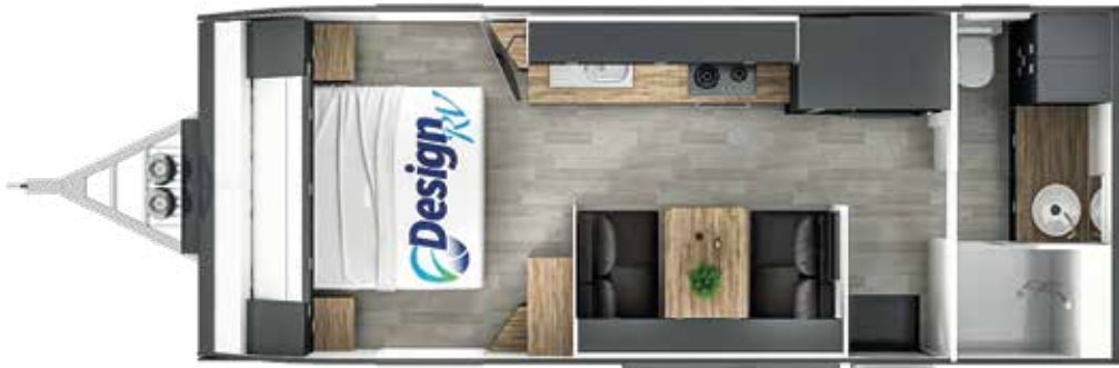
V6-1 · Size 21'