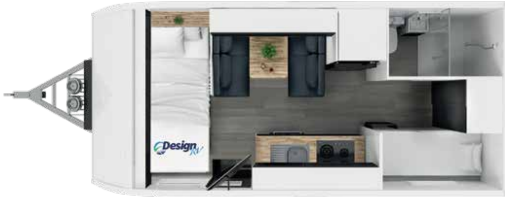
F1-2 · Size 18'8"